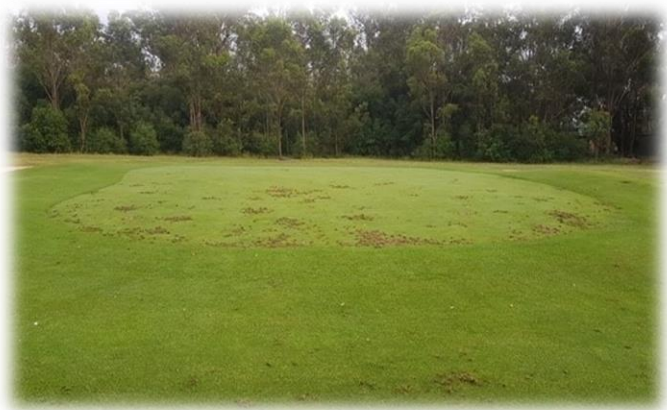
11 th green bird damage...