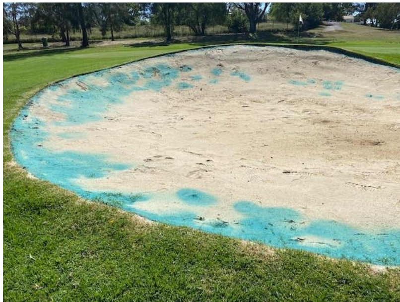
Spraying in bunkers for weed control...