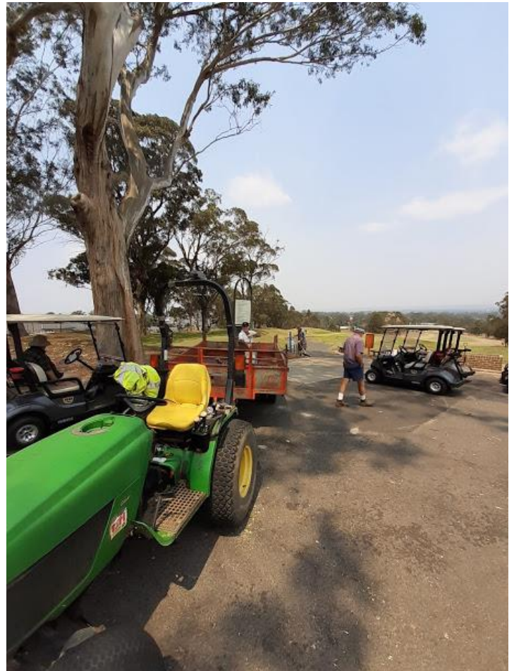
The team mulching memorial garden at 1 st .